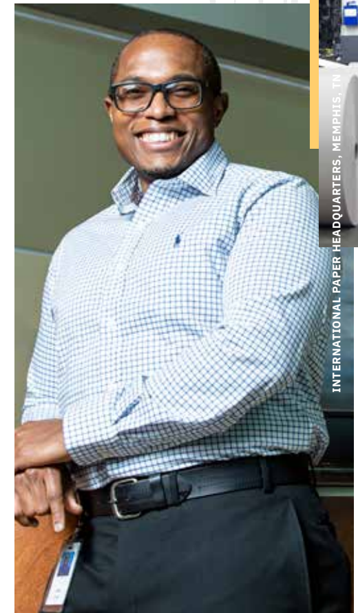
INTERNATIONAL PAPER HEADQUARTERS, MEMPHIS, TN

"THE OPPORTUNITIES ARE LIMITLESS. I FORMED SO MANY LASTING RELATIONSHIPS, NOT JUST WITH MY BUSINESS PROFESSORS, BUT WITH FACULTY MEMBERS IN MANY VARIOUS AREAS."